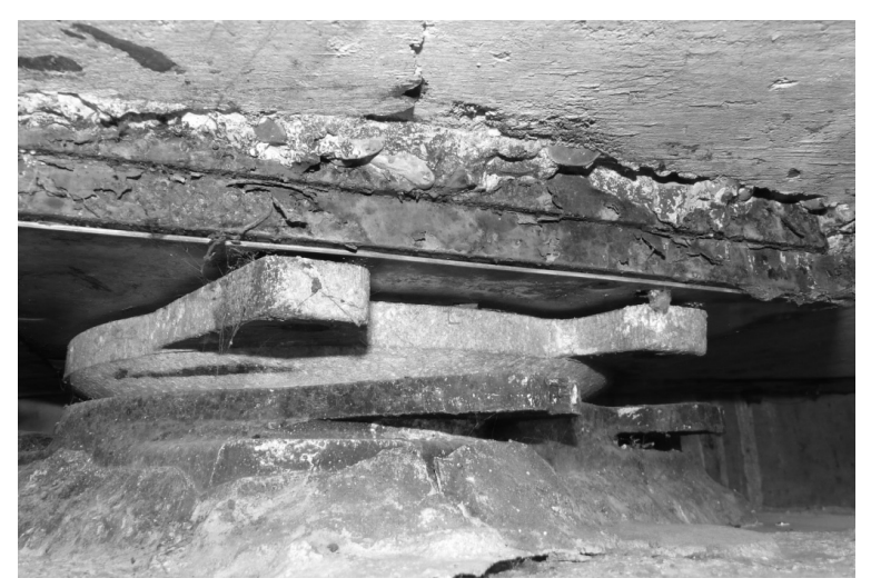
Vicarage bridge bearing